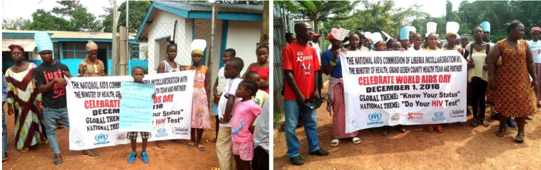
Celebration of World AIDS Day in PTP Camp under the theme “Know Your Status”.