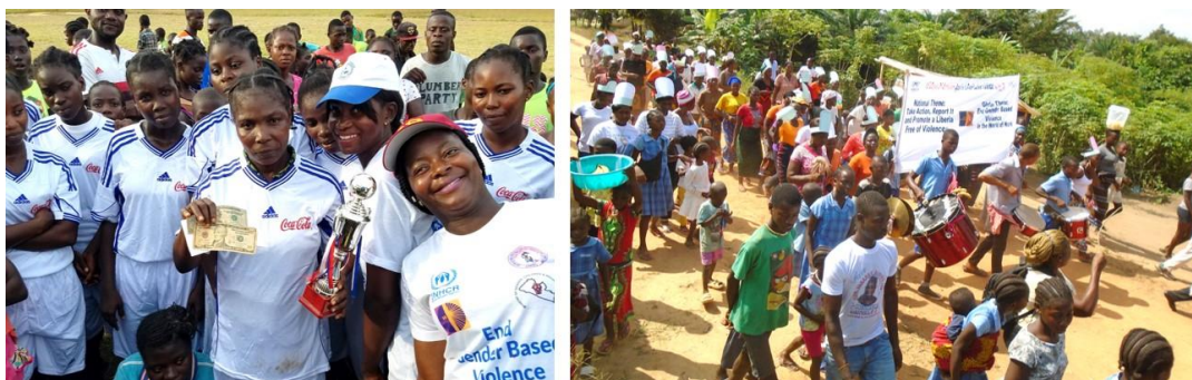
(L) In Little Wiebo Camp, the campaign was launched with a parade, an indoor programme which brought together representatives from Toffee and Yuwar Towns from the host communities. (R) Participants of the parade in Bahn Camp carried banners, posters and t-shirts with educative messages advocating towards the end of SGBV against women and encouraging reporting of attacks.