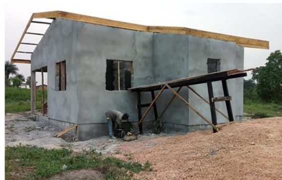
(L) UNHCR, AIRD & LRRRC joint site visit. (R) One of the 12 durable shelters.