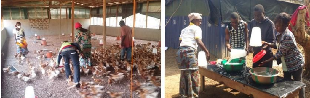
The project began in September 2018. Participants to the project include female-headed households and vulnerable households.