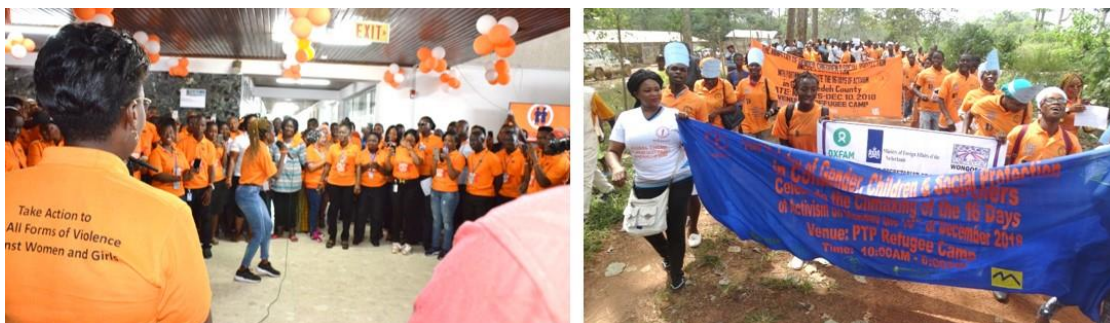
(L) UNHCR joined celebrations in One UN House in Monrovia, along with other UN Agencies and the Resident Coordinator; (R) Participants of the parade in PTP Camp.