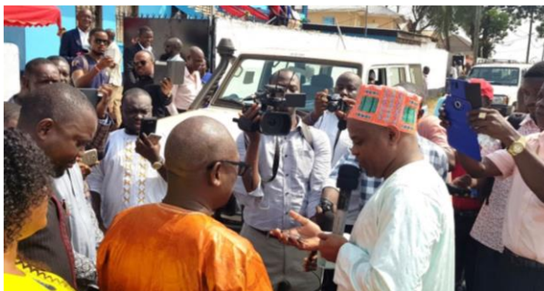
The Minister of Internal Affairs (in orange) and UNHCR Protection Officer (R) address journalists during the handover ceremony.