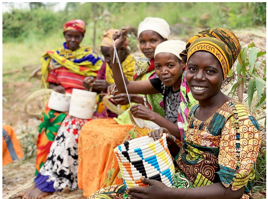
Burundian women, who have recently returned to Burundi from Mtendeli refugee camp in Tanzania, weave together in groups.

In celebration of World Refugee Day 2020, UNHCR's global brand of artisanal products crafted by refugees, MADE51, launched for the very first time an online shop . Homeware and accessories made by refugee artisans around the globe, including refugees living in Burundi, Kenya, Rwanda, South Sudan and Tanzania , can now be purchased by consumers to support UNHCR livelihood programs around the world. MADE51 highlights that when refugees flee, they carry with them traditions, skills and craftsmanship. By including them in global value chains, MADE51 offers refugees a way to earn an income and the opportunity to rebuild their lives and establish independence. This is particularly crucial considering the current COVID-19 pandemic that has affected the livelihood of many refugees. Country operations have