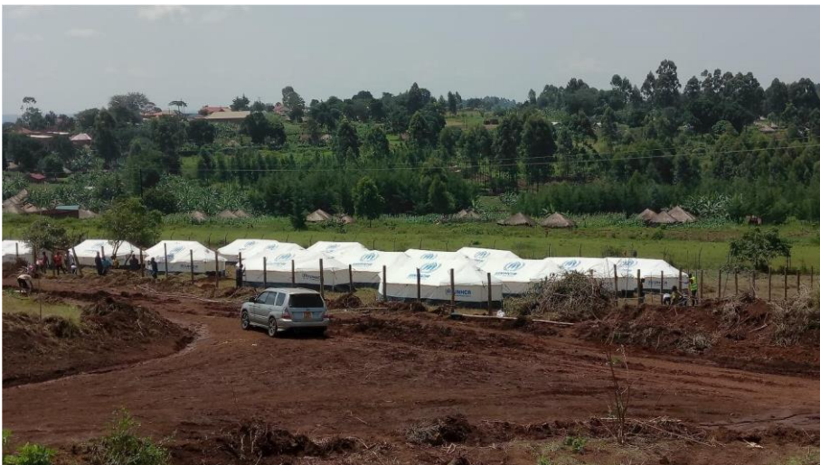
Installation of family tents at the Institutional Quarantine Centre (IQC) in Zombo-DFI.

In Uganda , preparations have been made to receive refugees from the DRC through two border entry points that were temporarily opened on 1 July to admit Congolese asylum seekers who had been stranded at the border since late May. UNHCR has worked with the Government to ensure that screening, quarantine facilities and emergency assistance are in place, including the prepositioning of 5,000 test kits for COVID-19. The Ministry of Health has deployed a team on the ground in coordination with the National Laboratory for the collection, transportation and testing of samples taken. A joint response strategy for health and nutrition has been developed by all partners on the ground.