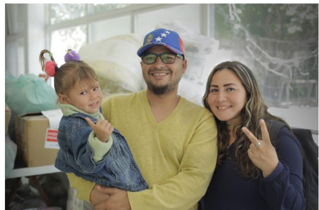
Venezuelan family receiving winter items in Montevideo