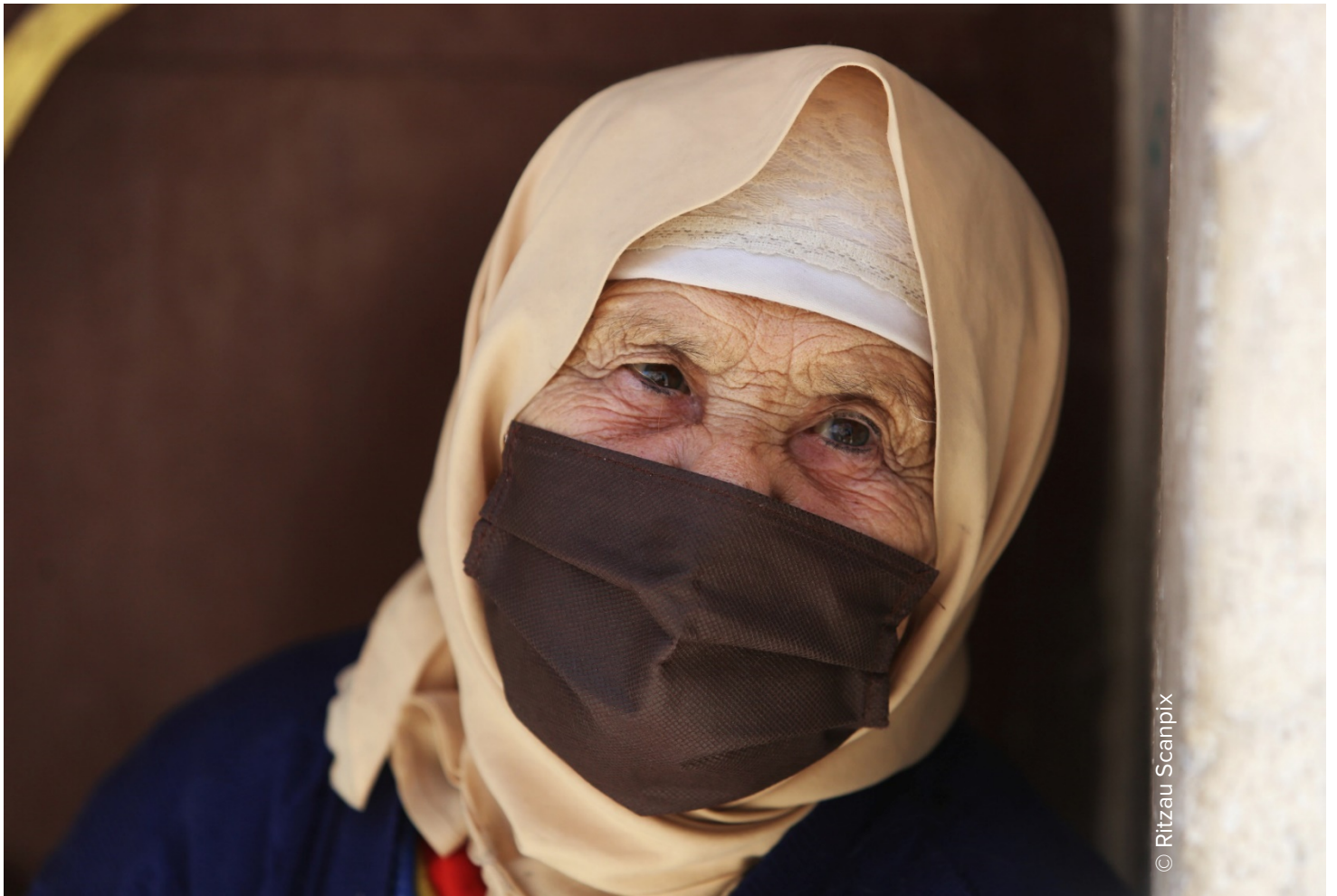
A Syrian refugee sits inside the Wavel refugee camp, in Lebanon's Bekaa Valley.