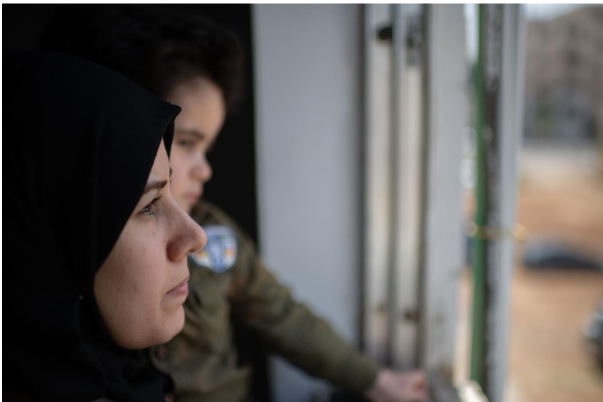
Jordan. Economic impact of COVID-19 makes life difficult for Syrian refugees.