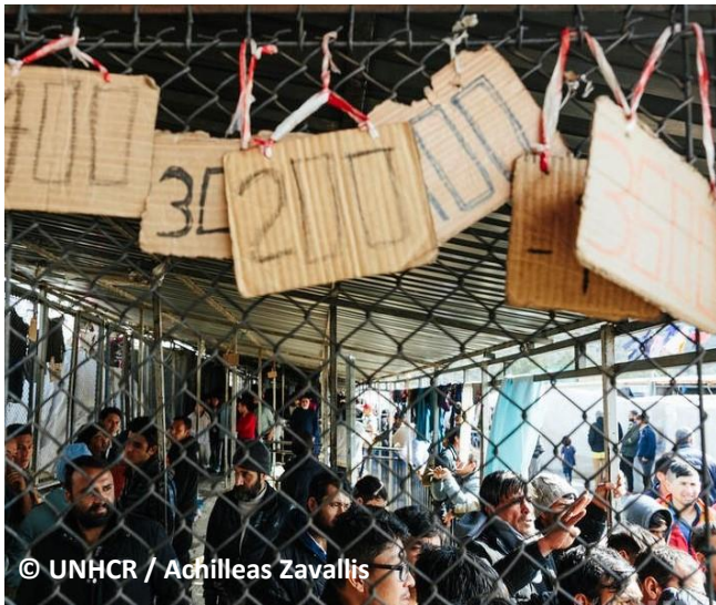
Refugees on the island of Lesbos

stock for 5,000 persons and provision of essential items to 10,000 persons recently arrived / arriving in the islands is urgent. Over 35,000 persons of concern currently reside in overcrowded RICs (of 5,400 capacity) and precarious shelter arrangements with poor sanitation inside and outside the RICs persist. Warehousing and dispatch of tents, blankets, sleeping bags, tarpaulins, hygiene items and baby care kits are crucially needed.