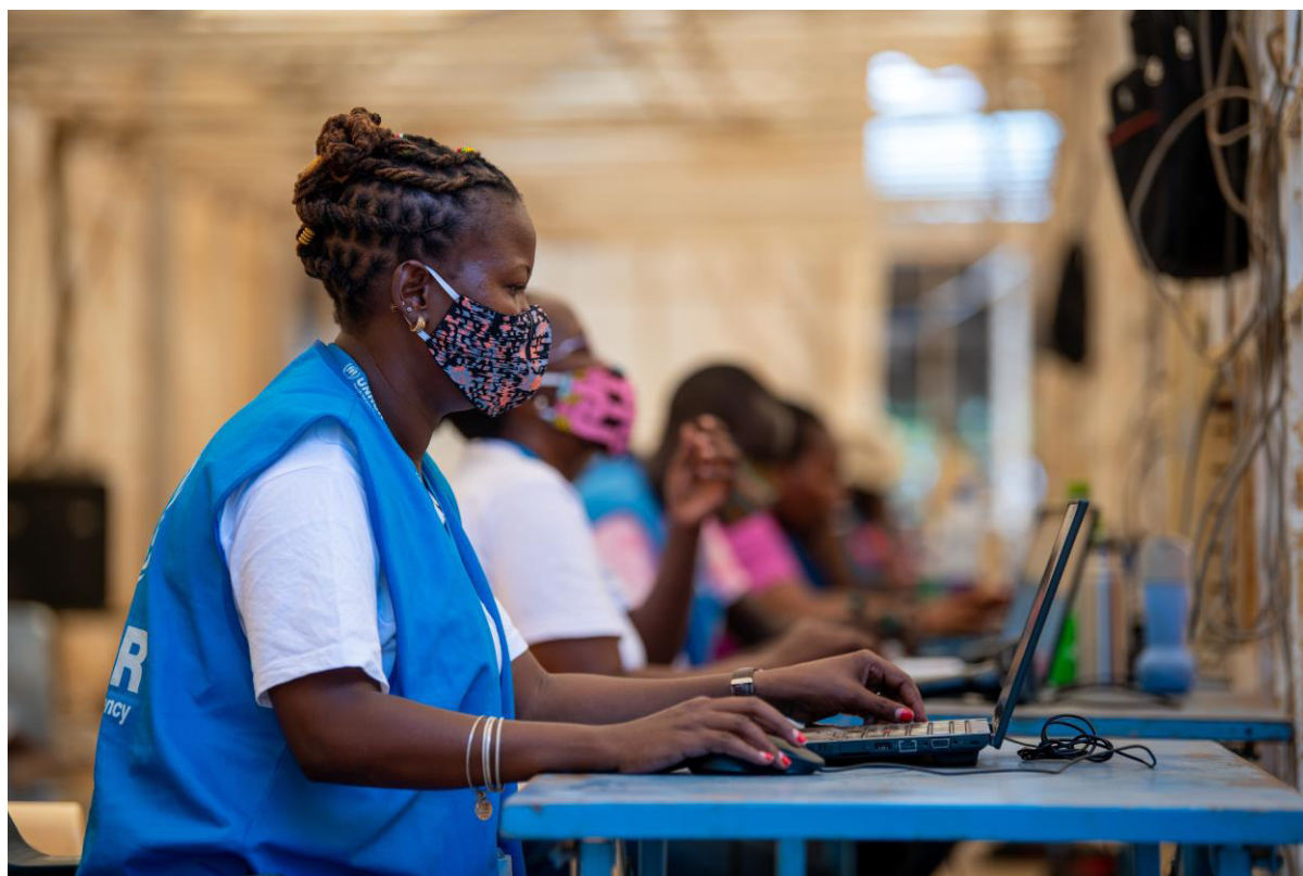
Kenya. UNHCR personnel manage a distribution centre for food and relief items in Kenya.