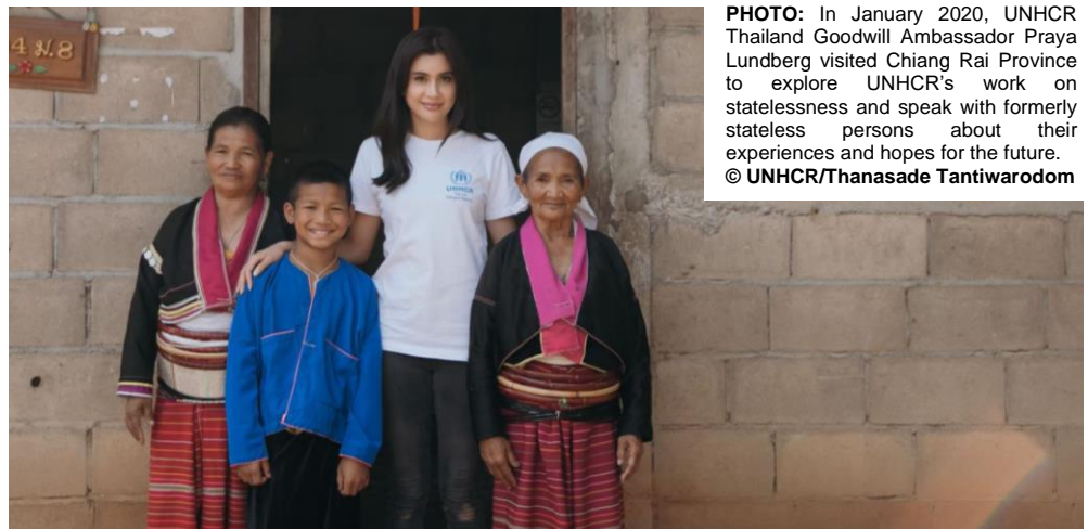
PHOTO: In January 2020, UNHCR Thailand Goodwill Ambassador Praya Lundberg visited Chiang Rai Province to explore UNHCR's work on statelessness and speak with formerly stateless persons about their experiences and hopes for the future.