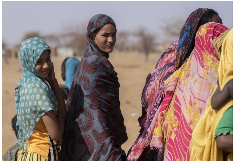
Malian refugee women who lived in Goudoubo camp before they were moved following the increase in attacks and the repeated threats on their community since the beginning of 2020.