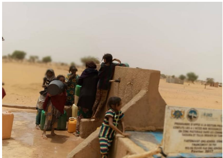
In Temelces, the large influx of refugees and IDPs since the beginning of the year has increased pressure on already limited basic services and natural resources such as water.