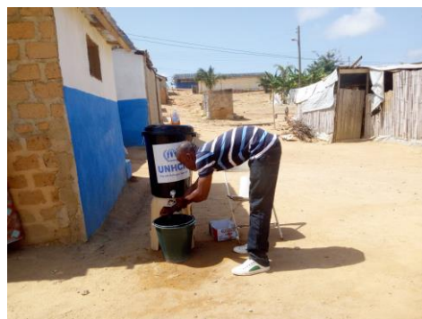
A refugee practising good hand hygiene at one of the hand washing stations in the Egyekrom Camp

01 Country Office in Accra 01 Field Office in Takoradi