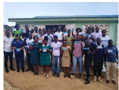
Some participants at the workshop on protection from sexual exploitation and abuse