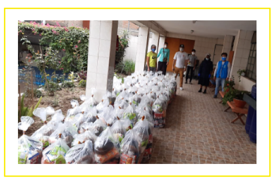
Food distribution with CIREMI in Lima

More than 650 refugees and migrants are receiving shelter and daily food support in over 20 shelters/collective accommodations supported by UNHCR in Arequipa, Lima, Puno, Tacna and Tumbes.