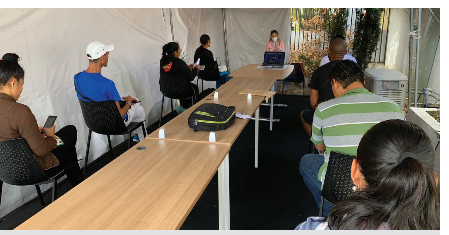
Preparing to assist the most vulnerable in Costa Rica

The transfer value will depend on family size. Families with elderly (family members over 60 years) and with documented chronic medical conditions will receive monthly payments for the duration of the crisis. In addition to contact details in PRIMES, UNHCR will use a range of communication channels with the beneficiaries to inform them of this opportunity, including social media campaigns, broadcast SMS messages and outreach through community leaders.