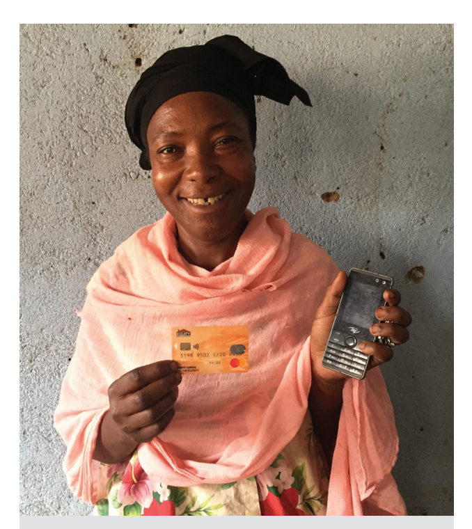
Digital payments in Uganda

The government of Morocco has declared a state of national health emergency responding to the increasing number of persons contracted COVID-19. UNHCR has therefore advanced the payments under the existing cash assistance for the most vulnerable, and reprioritized within the current available funds to support all refugees with a one-time off cash assistance to alleviate the economic impact of COVID-19.