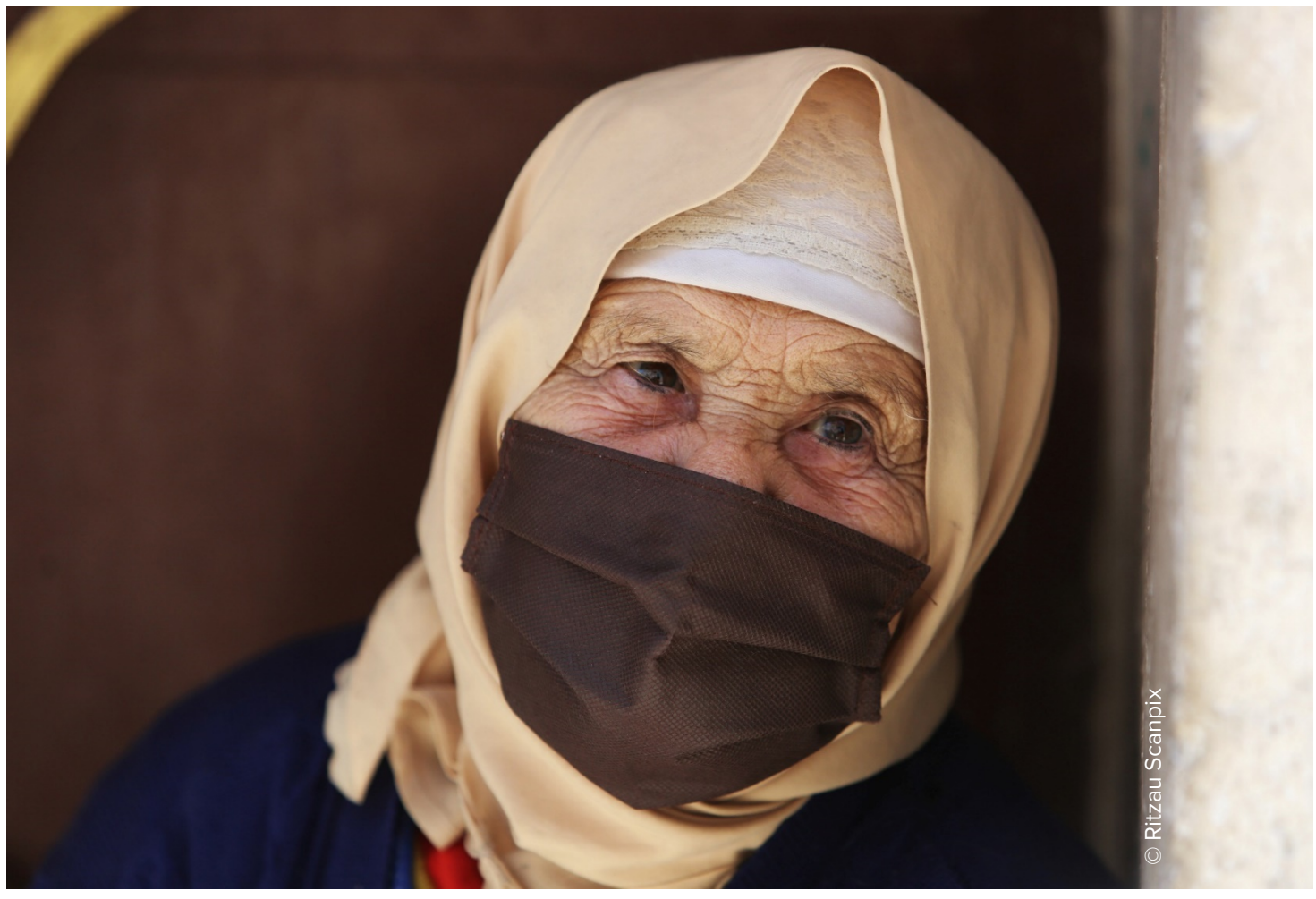
A Syrian refugee sits inside the Wavel refugee camp, in Lebanon's Bekaa Valley.