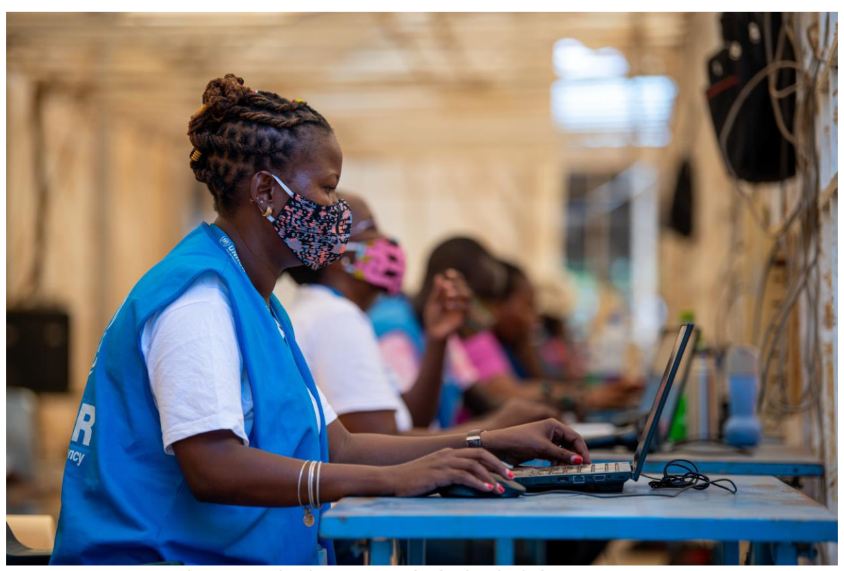
Kenya. UNHCR personnel manage a distribution centre for food and relief items in Kenya.