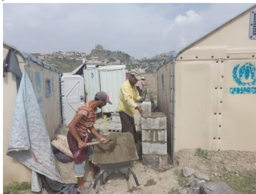
UNHCR began rehabilitation and upgrading of 35 Refugee Housing Units installed in Hajjah city, including improving the water drainage, fire safety and privacy elements.

Close to 1,000 refugees, asylum seekers, and Yemeni nationals accessed urgent health services at the five UNHCR supported clinics during the reporting period. UNHCR activities reached nearly 3,300 refugees and host community members. Some 200 refugees received mosquito nets and awareness-raising material on insect-transmitted diseases, including malaria, dengue and chikungunya. In Aden and Sana'a, clinics reported an increased number of patients suffering from a fever-like illness; UNHCR is verifying if these cases are associated with COVID-19.