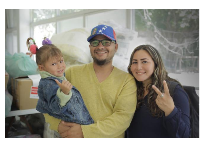
Venezuelan family receiving winter items in Montevideo