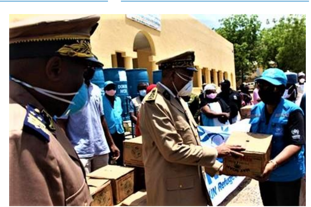
Head of UNHCR – Sub Office Maroua, handing over UNHCR's donation to the Governor of the Far North Region