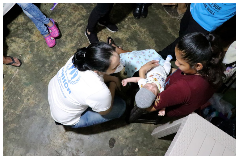
UNHCR and partners ensure the continuity of humanitarian and protection programmes to refugees during the COVID pandemic.

UNHCR and partners have adapted their operations to include social distancing measures to protect staff, the people of interest and host communities from COVID-19. Registration, counselling and life-saving protection and assistance activities are conducted limiting exposure and risks in the field or remotely, via WhatsApp, phone calls and text messages.