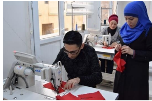
Syrian refugees learn shirt sewing in preparation for their job placement in the textile industry.

Monitoring the voluntary nature of self-organized returns: In cooperation with the İzmir PDMM, UNHCR started to monitor the voluntary nature of spontaneous returns involving Syrian refugees in August 2018 by observing and providing interpretation support to the return interviews conducted by PDMM.