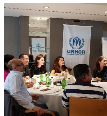
Municipal staff from İzmir's Konak district municipality engage in a discussion during the Needs Assessment and Case Management training in İzmir.

İzmir's Konak and Buca district municipalities signed Letters of Understanding with UNHCR in 2018. As a result, a Refugee Support Desk was established in the Buca district municipality to identify persons with high protection risks and support referrals to relevant institutions, as well as provide counselling and translation services to local community leaders such as mukhtars, municipal staff and school teachers on matters concerning refugees. In the Konak district municipality, a project was established to support impoverished and refugee-dense neighbourhoods by providing family hygiene kits, mold cleaning sets and medical equipment such as wheelchairs.