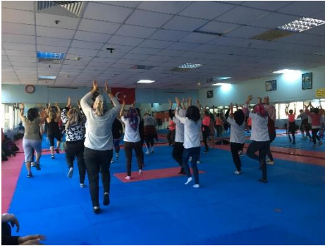
Refugee women take part in a zumba dance activity in support of the 16 Days of Activism against SGBV campaign in İzmir on 20 December 2018.

Child protection, Sexual and Gender Based Violence (SGBV) prevention and response, identification of and social support to refugees with specific needs: Two Best Interests Procedures (BIP) workshops were organized for the Association for Solidarity with Asylum Seekers and Migrants (ASAM) in İzmir, with the participation of 28 staff working in İzmir, Muğla and Aydın provinces. The workshops aimed to develop the capacity of partner staff involved in the BIP process to produce high quality Best Interests Assessments and Best Interests Determinations, which are conducted by a panel of experts when particularly important decisions affecting a child need to take place.