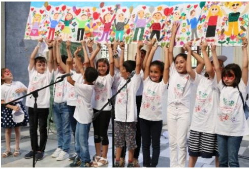
Refugee children gather with their local peers in Izmir to mark World Refugee Day on 27 June 2018.

Provincial and local institutions and service providers are provided with material and technical support to strengthen their ability to meet the increased demand in services, particularly by the most vulnerable refugees. As such, UNHCR places special attention on the identification of, and response to, persons with specific needs, enhanced protection monitoring and strengthened referrals to public service providers to support access to effective protection. By widening its networks with partners and key influencers at the local level, such as municipalities, mukhtars and imams, in locations hosting high numbers of refugees, UNHCR consolidates communication, between refugees and host communities as well as refugees and service providers. UNHCR also promotes social cohesion among refugee and host communities, and enhances