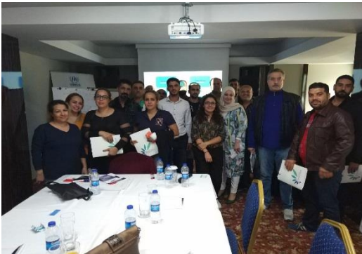
Refugee volunteers discuss their communities' challenges encountered by in Manisa.

Social cohesion: In cooperation with the Union of Aegean Municipalities and Turkish Association of Social Workers (TASW), UNHCR organized the first Social Service and Cohesion Camp for municipal staff in İzmir's Çeşme district. In total, 49 representatives from different metropolitan and district municipalities and six TASW branch offices (in İzmir, Aydın, Manisa, Muğla, Denizli and Antalya provinces) attended the two-day workshop. The workshop supported the capacity development of municipal staff working in social services on topics such as refugee rights, international and national protection framework. Participants also worked in groups to identify gaps in service provision, map services and referrals provided by the municipalities.