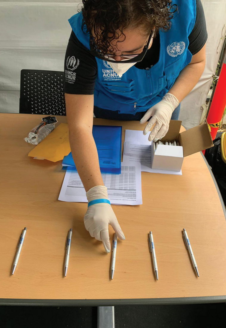
Preparing to assist the most vulnerable in Costa Rica