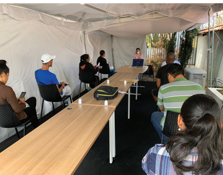
Preparing to assist the most vulnerable in Costa Rica

The transfer value of COVID-19 grants depends on family size. Families with elderly (family members over 60 years) and with documented chronic medical conditions will receive monthly payments for the duration of the crisis, and others receive either one-off or monthly payments depending on the level of vulnerability and type of shock. In addition to contact details in PRIMES, UNHCR is using a range of communication channels with the beneficiaries to inform them of this opportunity, including social media campaigns, broadcast SMS messages and outreach through community leaders. UNHCR will start delivering cards through courier service in the coming weeks with strict COVID-19 preventative measures combined with online/phone training on card use and how to protect oneself and family members under COVID-19.