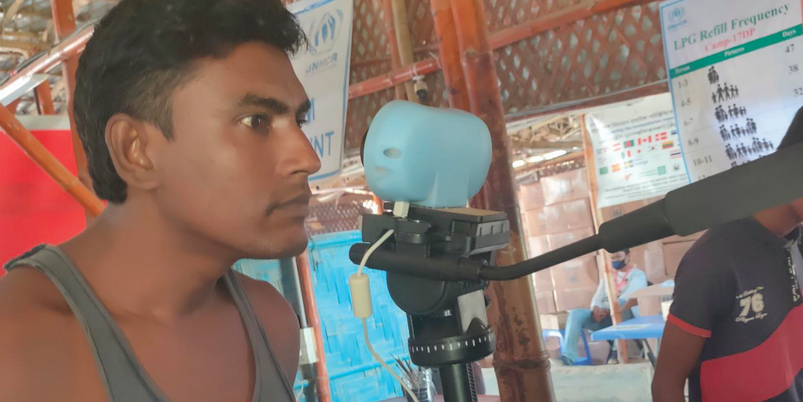
Testing contactless biometrics in Bangladesh