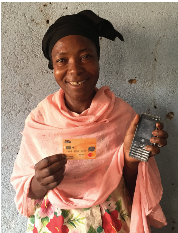
Digital payments in Uganda

The government of Morocco has declared a state of national health emergency responding to the increasing number of persons contracted COVID-19. UNHCR has therefore advanced the payments under the existing cash assistance for the most vulnerable, and reprioritized within the current available funds to support all refugees with a one-time off cash assistance to alleviate the economic impact of COVID-19.