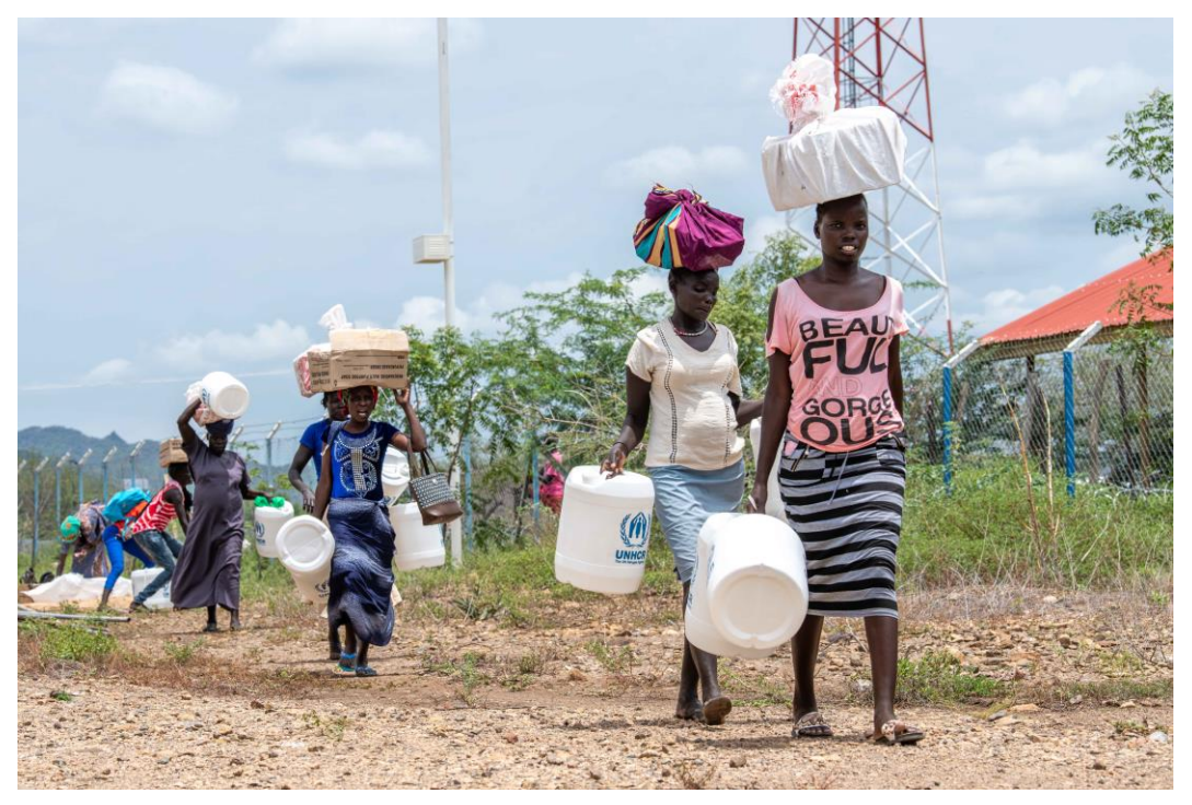
Refugees walk home after receiving Core Relief Items (soap and jerrycans) during a CRI distribution by UNHCR in Kalobeyei Settlement.

On 20 – 27 April 2020, UNHCR distributed Core Relief Items (Soap, firewood and jerrycans) to the population of concern in Kalobeyei Settlement. To enhance prevention of the spread of covid-19, UNHCR suspended the distribution of soap through Cash Based Intervention (CBI) and instead issued in-kind soap to the general population to ensure availability of soap. However, the office will continue to distribute Sanitary kits through CBI for the persons of concern in Kalobeyei settlement.