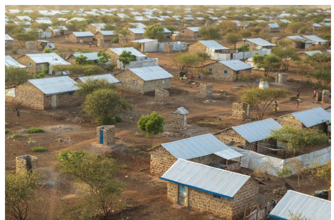
Aerial view of permanent houses constructed by refugees in Kalobeyei Settlement.

Amount in Kenya Shillings distributed through UNHCR's Cash Based Intervention since June 2018.