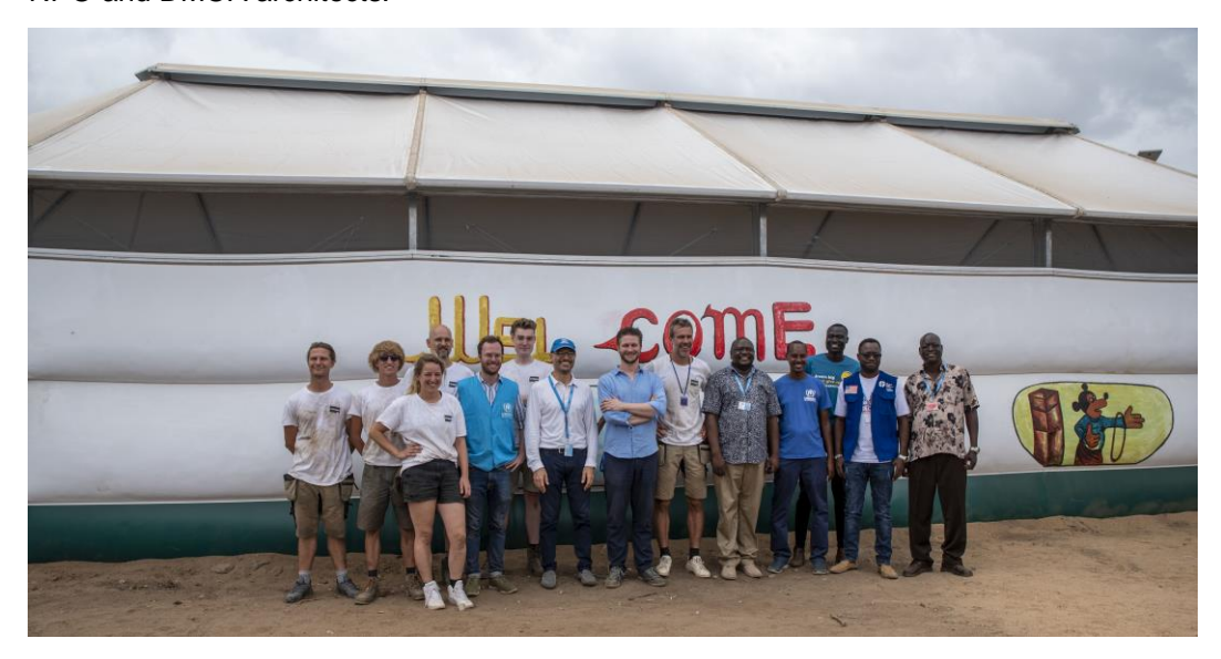
Maggie Shelter team, UNHCR and LWF colleagues pose for a photo outside one of the two Innovation Schools put up at Fashoda Primary School in Kakuma camp.