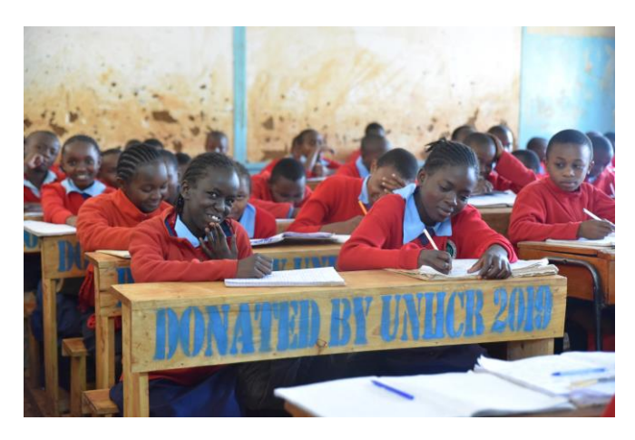
Kenyan and refugee pupils at Kabiria primary school in Nairobi. This is one of the public schools that received 36 desk donations from UNHCR courtesy of generous contribution from the Big Heart Foundation.