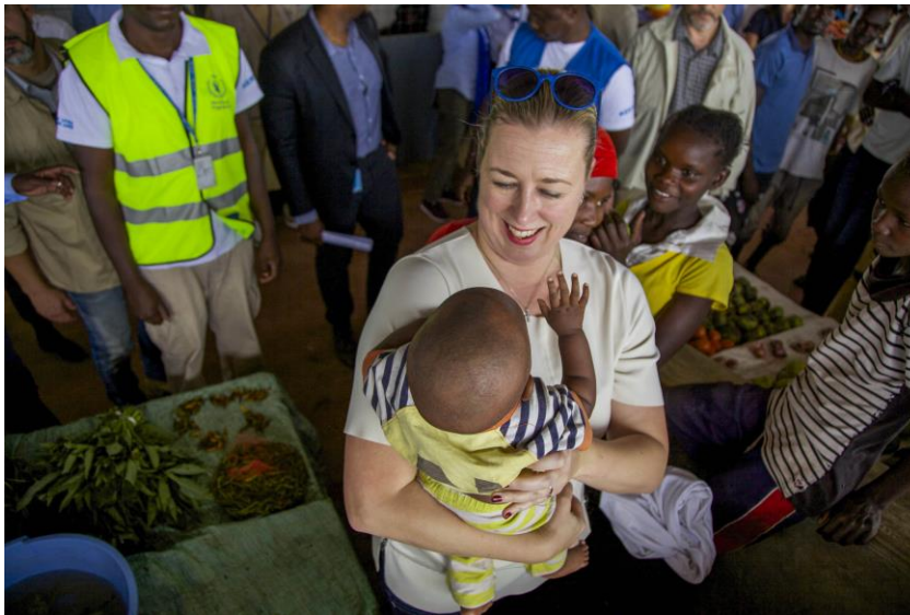
Photo: EU Commissioner for International Partnerships, Ms. Jutta Urpilainen, holds a refugee child during her visit to Kalobeyei settlement.