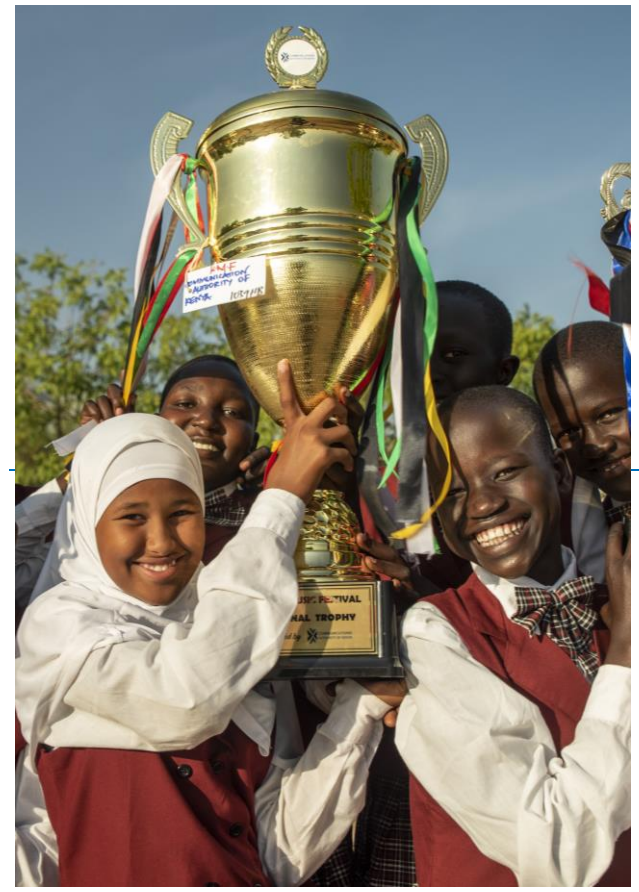
Angelina Jolie schoolgirls pose for a photo with one of the 10 trophies won at the Kenya National Music Festival.

Refugee and Kenyan girls top 2019 National Music Festival