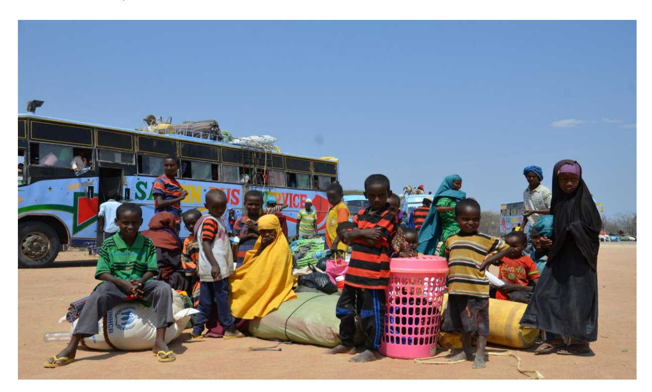
Refugees returning to Somalia under UNHCR's voluntary repatriation Program.

The second relocation convoy to Kakuma was organized on the 28<sup>th</sup> of September 2019, having on board 79 individuals comprising of 30 households. The refugees have safely arrived in Kakuma refugee camps. So far, a total of 165 refugees have been relocated from Dadaab to Kakuma since the exercise started on 14<sup>th</sup> September 2019.