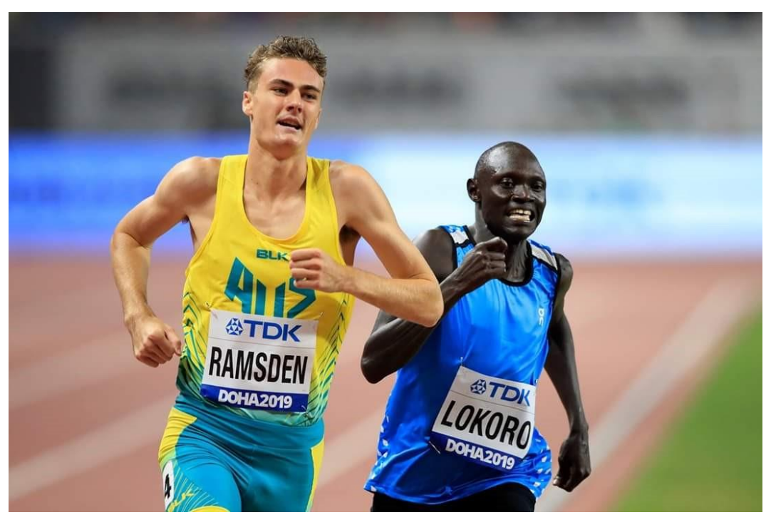
Paulo Amotun, refugee athlete from Kakuma, represents competes in the men's 1,500M race during the IAAF World Championships 2019 Doha.

https://www.iaaf.org/competitions/iaaf-world-championships/iaaf-world-athletics-championships-doha-2019-6033/results/men/1500-metres/heats/summary