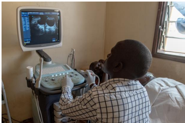
An Ultrasound scan is performed on an expectant mother to monitor the well-being of the expected child at the Kakuma General Hospital. 279 patients benefited from Ultrasound scan of various conditions.