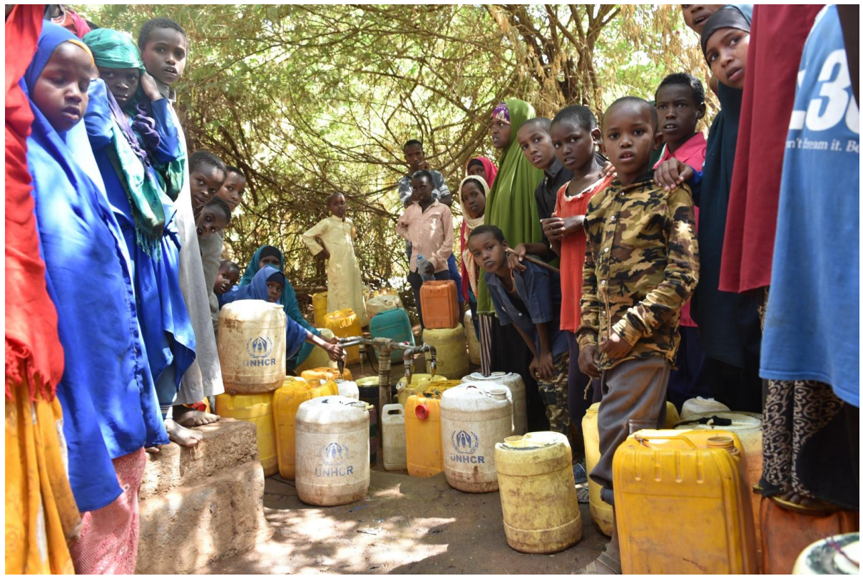
Refugees collect water from one the water distribution points in Ifo camp of Dadaab.

During the reporting period, UNHCR supplied on average of 32 liters of water per day per capita from 22 boreholes to the entire refugee population in the three Dadaab camps. Nineteen (19) of these boreholes operate on Solar PV- Diesel hybrid system. The water supply schemes convey water to 38 tanks with a total storage capacity of 4,550 m³, distributed through a pipeline network of 235 km and relayed to 668 tap stands with about 2,784 taps, scattered around the three camps.