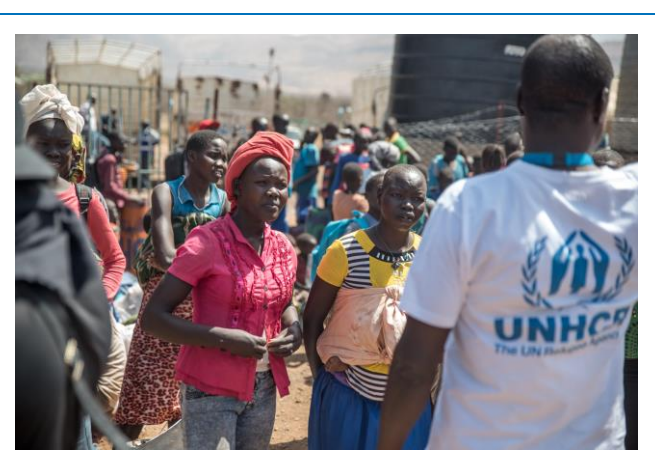
Newly arrived refugees are briefed by a UNHCR staff at Nadapal Transit centre before being facilitated to Kakuma Camp. Over 75% of registered newly arrived refugees are from South Sudan.

Refugees facilitated for long-term solutions (resettlement) through Complementary Pathways in 2019.