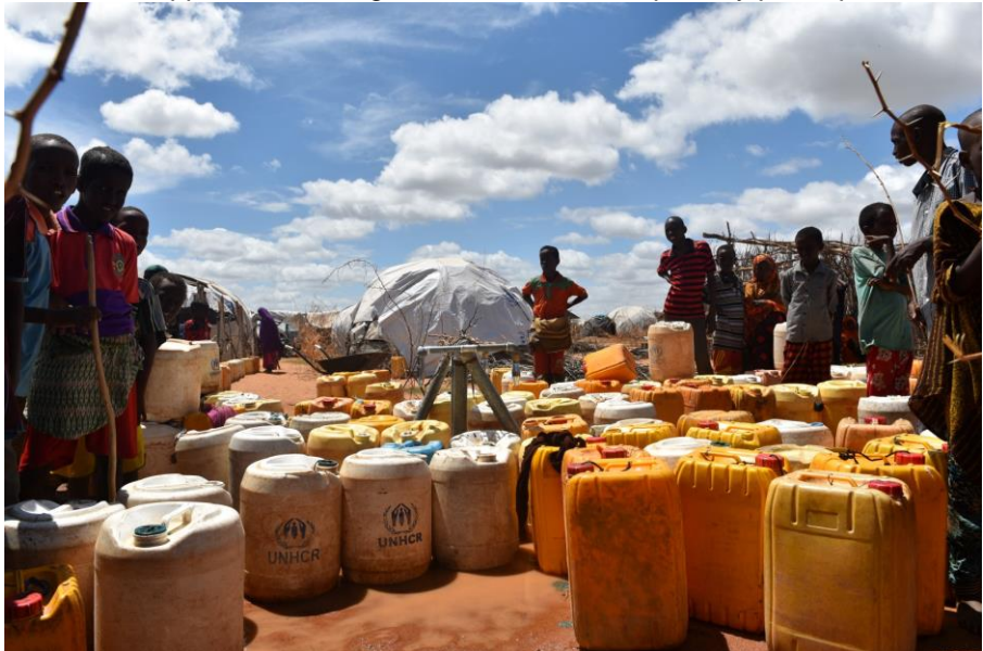
Refugees collect water from one the water distribution points in Dagahaley camp of Dadaab.

the entire refugee population in the three Dadaab camps. The water supply schemes convey water to 38 tanks with a total storage capacity of 4,550 m3, distributed through a pipeline network of 233.7 km and relayed to 661 tap stands with about 2,714 taps, located within the three camps.