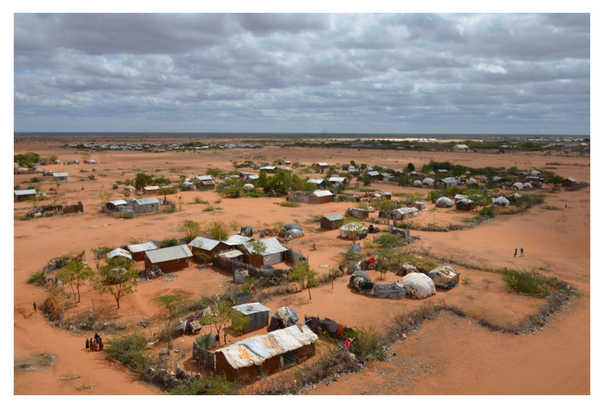
Ifo 2 camp of Dadaab closed on 31st May 2018.