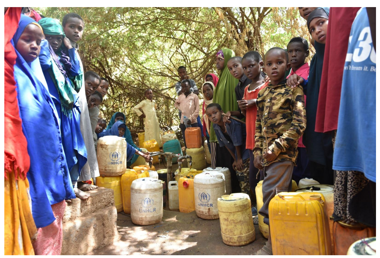
Refugees collect water from one the water distribution points in Ifo camp of Dadaab.

During the reporting period, UNHCR supplied on average 33.7 liters of water per day per capita from 27 boreholes to the entire refugee population in the four Dadaab camps. 26 of these boreholes operate on Solar PV- Diesel hybrid system. The water supply schemes convey water to 45 tanks with a total storage capacity of 5,550 m3, distributed through a pipeline network of 297.5 km and relayed to 845 tap stands with about 3,926 taps, scattered around the four camps.