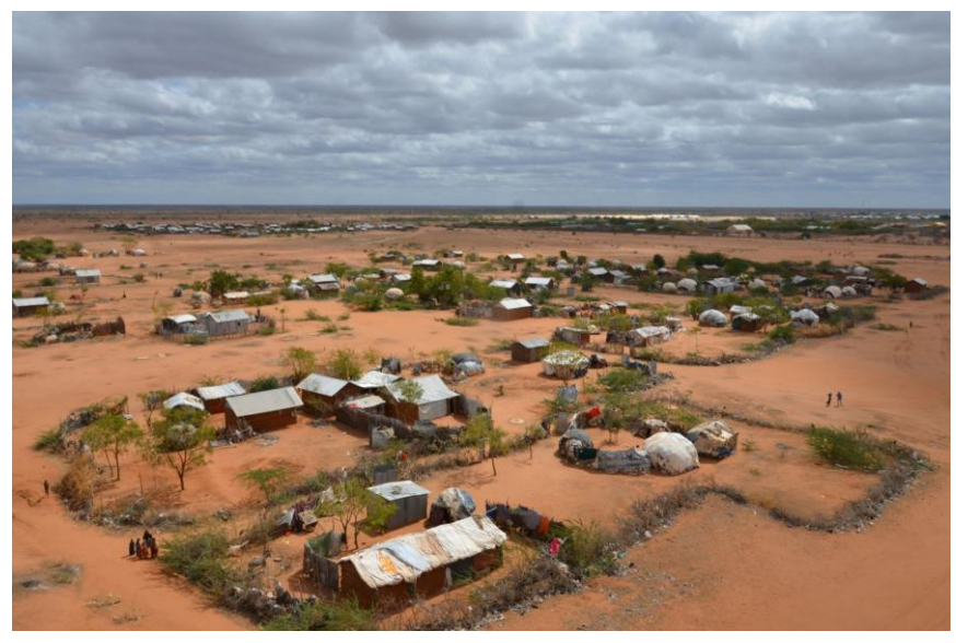
Ifo 2 camp of Dadaab with current population of 19,814 individuals.