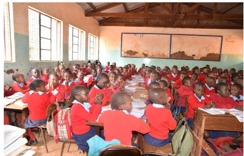
Kenyan and refugee pupils at Kabiria primary school in Nairobi. This is one of the 18 public schools that received 36 desks from UNHCR courtesy of generous contribution from the Big Heart Foundation. More than 600 desks were issued to various schools