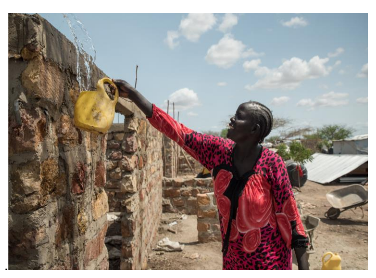
A refugee woman in Kalobeyei settlement pours water on her house to cure the cement. UNHCR has rolled out the first cycle of CBI for shelter in which 200 refugee families have started the construction of their permanent homes.