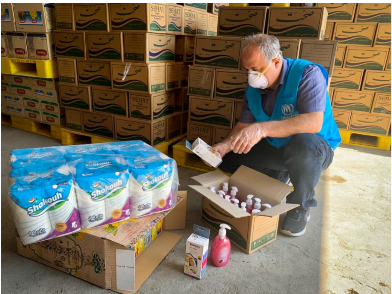
A UNHCR staff-member packs aid-items to distribute to refugee settlements in Iran, as part of its COVID-19 response.

In advocating for inclusion and highlighting the dangers of exclusion, UNHCR has a unique role. Through its operational presence, UNHCR can support medium and small health clinics and hospitals in areas close where people of concern live. While assistance is available for both displaced and host communities, the added value of ensuring the host population understands that this assistance comes from the agency responsible for the refugees helps foster social cohesion and prevent inter-communal conflict.