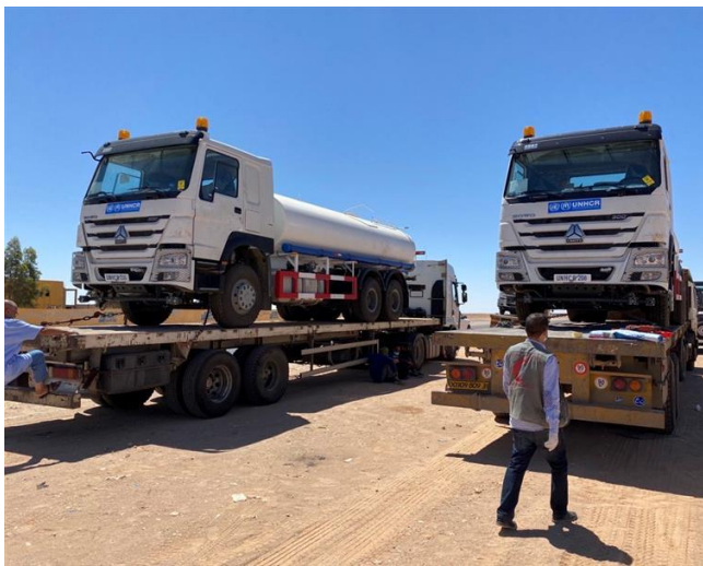
Five water trucks were provided to the Sahrawi refugee community in May, making a total of eight since April.

During the COVID-19 pandemic , UNHCR has adapted its activities to the changing circumstances, while continuing to provide lifesaving assistance.