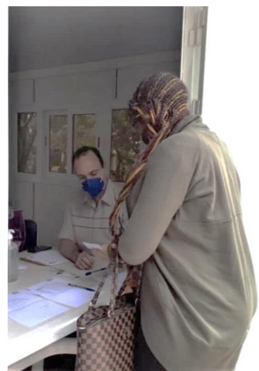
Cash-based assistance for refugees, adapted to COVID-19 preventive measures.