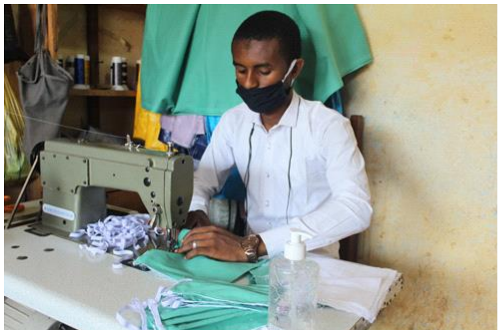
Un jeune réfugié participe à la production des masques pour la prévention contre la COVID-19