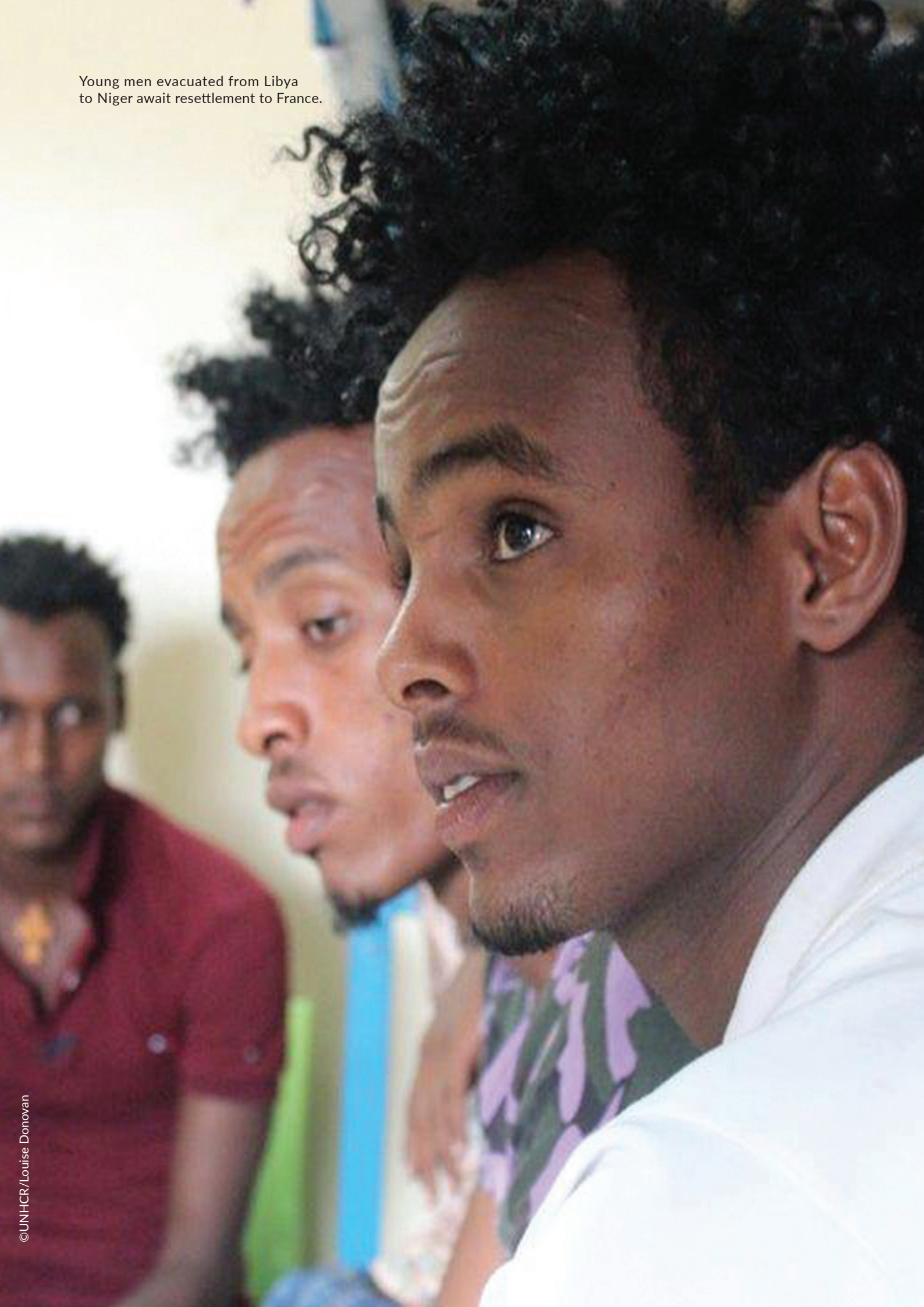
Young men evacuated from Libya to Niger await resettlement to France.