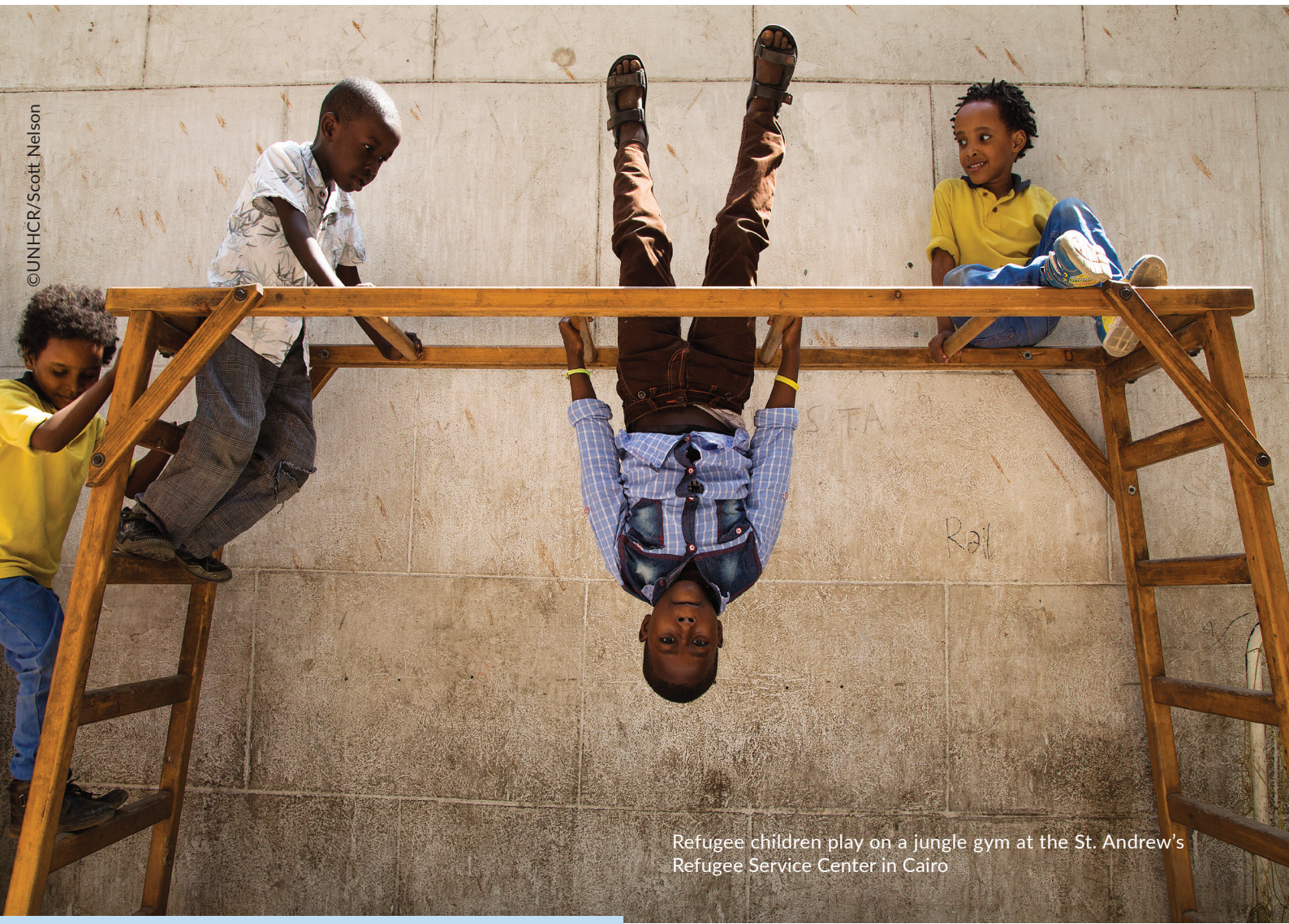
Refugee children play on a jungle gym at the St. Andrew's Refugee Service Center in Cairo

Recreational and social activities will be enhanced, and also benefit host communities: Sports-for-Protection and recreational activities including the use of art therapy have the unique ability to engage young people as well as foster social cohesion among refugees and host communities, promote well-being and build peer support networks. Under this objective, existing successful programs such as the tournament and sports camp program in Cairo, and Child and Refugee Community Centres in Addis and Kassala, will be expanded across all target locations to reach more young people. Refugee youth will be encouraged to lead and implement activities which they have designed, with the involvement of the host community. Recreational activities may also link up with psycho-social counselling, for example through art, music, or drama therapy.