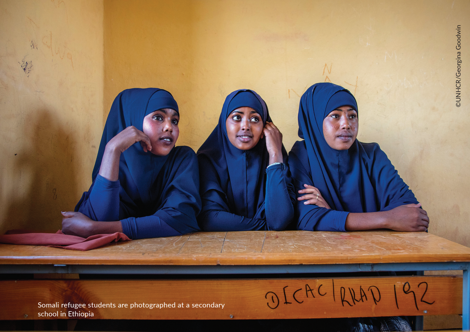
Somali refugee students are photographed at a secondary school in Ethiopia