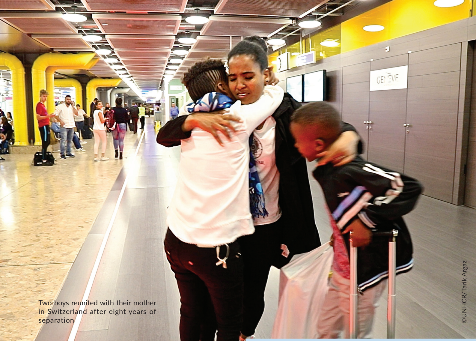
Two boys reunited with their mother in Switzerland after eight years of separation