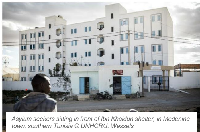
Asylum seekers sitting in front of Ibn Khaldun shelter, in Medenine town, southern Tunisia

Field Presence in Medenine, Sfax and Gabes