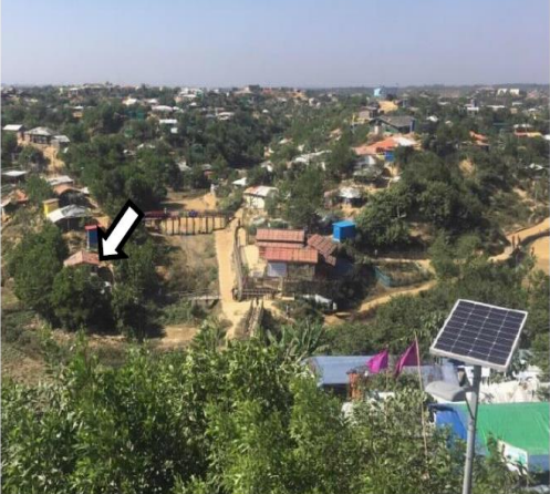
A view from UNHCR's distribution point in Camp 17 (Kutupalong refugee settlement) in 2018 (left) and 2019 (right), which demonstrates the regrowth taking place with the assistance of the LPG intervention. An arrow points to the same location in each photograph.