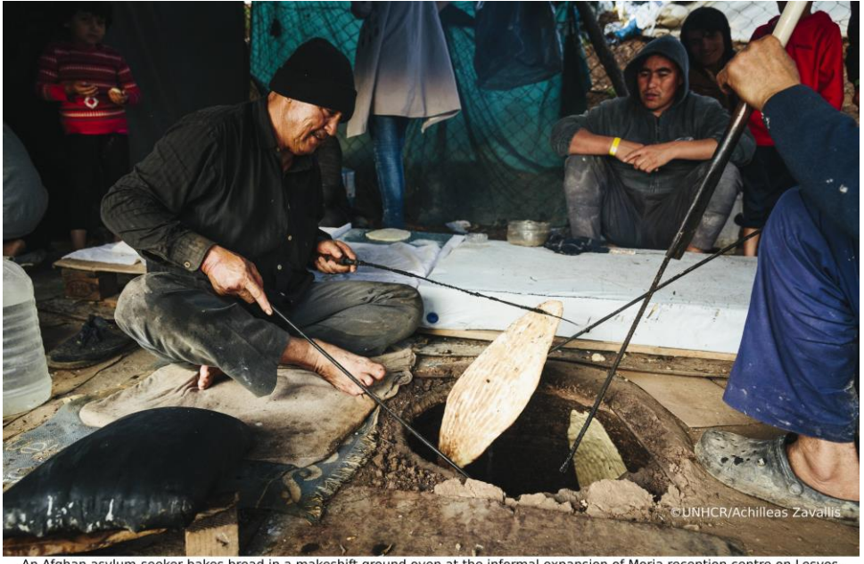
n Afghan asylum-seeker bakes bread in a makeshift ground oven at the informal expansion of Moria reception centre on Lesvo