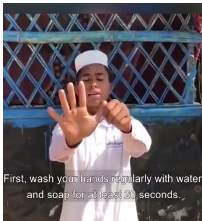
Young refugee boy demonstrating basic precautions needed to prevent the spread of COVID-19. Click on the picture to watch the video