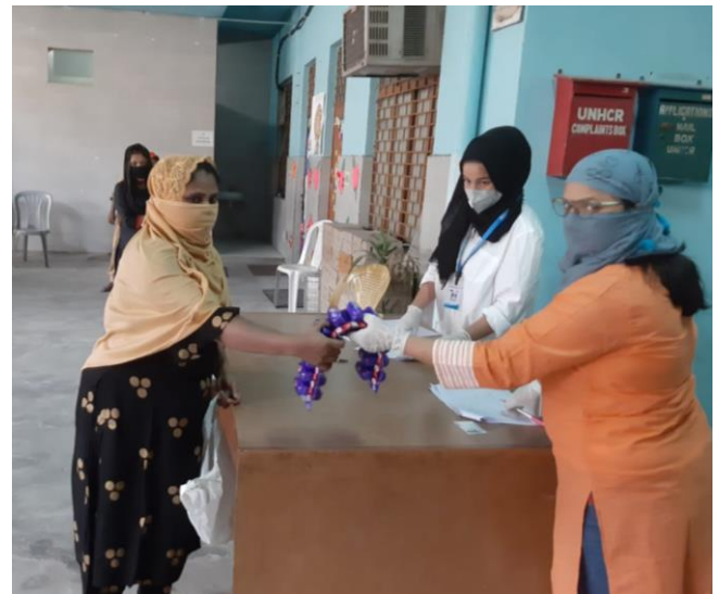
Distribution of toilet cleaners for refugees and asylum Seekers by UNHCR partner in Delhi

A distribution of hygiene materials such as soap bars and toilet cleaners reached 959 families between 23 April to 29 May. Refugees, asylum seekers and their immediate host community members have been targeted as part of this assistance to foster inclusion. Cumulatively, 7,674 vulnerable refugee, asylum seeker and host community families have been supported with soap or toilet cleaners in response to the COVID-19 emergency.