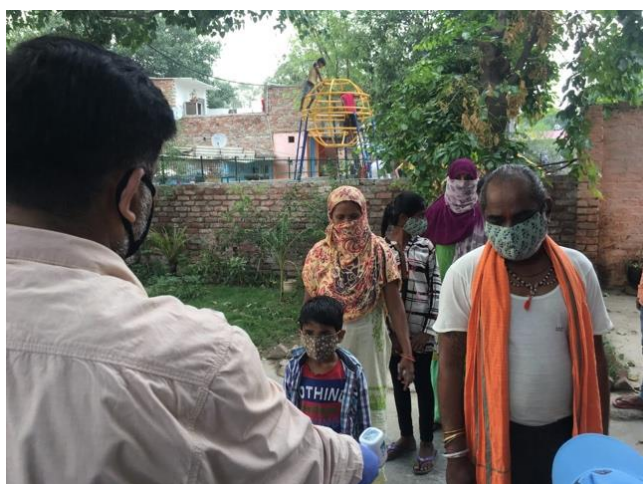
Refugee made mask were distributed to vulnerable host communities with support of Youth Feed India as part of campaign

As a part of the “ Give As You Take, This Time ” campaign, UNHCR in collaboration with Silaiwali, Jesuit Refugee Service (JRS), Fair Trade Forum-India (FTF-I), Ummid Ki Udhan, 40,000 homemade masks are being distributed for free to local administration, vulnerable host community population along with vulnerable refugees and asylum seekers.