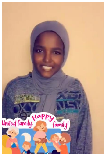
Messages from a refugee youth in Delhi on Family Day compiled by UNHCR Partner, Click on the image to watch the video

reported since movement restrictions have been in place. 10 tele-sessions on self-care, (including psycho-social, emotional and physical aspects) and SGBV/PSEA sensitization were organized jointly with UNHCR partner, targeting 10 women groups of different nationalities across locations, reaching out to 135 women in Delhi. Outside Delhi, partners remotely conducted 11 awareness raising sessions on SGBV, reaching out to 70 individuals.