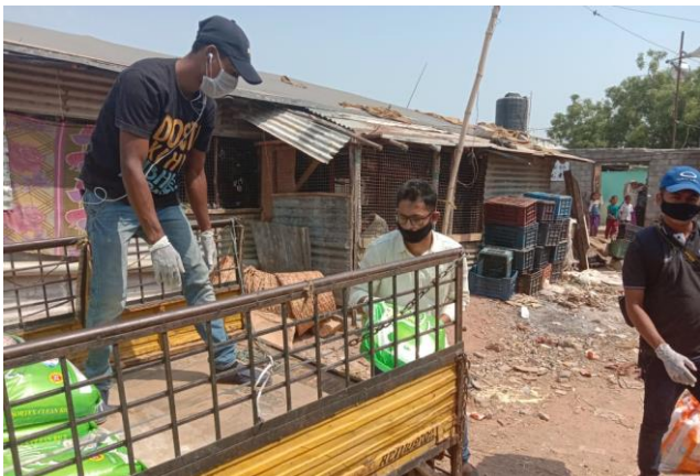
Food ration distribution for refugees and asylum Seekers by UNHCR partner in Hyderabad

Along with refugees and asylum seekers, their immediate host community members have been targeted as part of this continued assistance. A total of 8,751 food packets distributed to refugees, asylum seeker and host community families since the COVID-19 response was initiated.