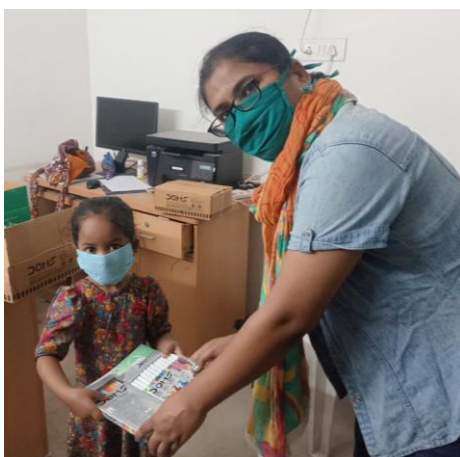
Refugee child being supported with art supplies by UNHCR partner in Jaipur

After the Global outbreak of COVID-19 pandemic, UNHCR operation in India is responding to the enormous humanitarian needs as a result of the pandemic. These efforts compliment those of the Government of India, UN agencies and partner organisations. UNHCR interventions have been designed to provide relief to vulnerable refugees, asylum seekers and host communities in similar situation. UNHCR is grateful for the timely donations both in cash and in-kind received in this period as we look ahead to continue in solidarity with those that need our assistance.