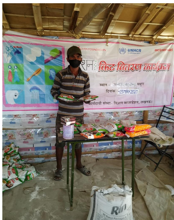
Food ration distribution for refugees and asylum Seekers by UNHCR partner in Uttar Pradesh

17 remote meetings were held with 95 refugee community representatives (63 males, 32 females) were organized through different modes. 4 telephonic community group meetings were held in line with the Age, Gender Diversity Mainstreaming principle which were attended by 16 participants (6 males, 10 females). Since the COVID-19 response effort was initiated 80 community group meetings have been held. Such meetings contributed towards identifying gaps in basic needs and protection issues to be addressed by UNHCR/partners/other stakeholders.