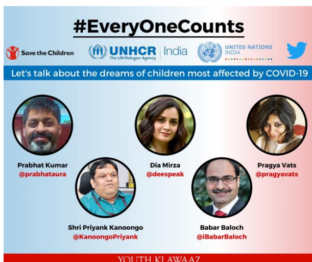
Panel member of twitter chat organised under the campaign Everyone Counts. Click on the picture to read more

As a part of the “ Give As You Take, This Time ” campaign, UNHCR in collaboration with Silaiwali, Jesuit Refugee Service (JRS), Fair Trade Forum-India (FTF-I), Ummid Ki Udhan, 40,000 homemade masks are being distributed for free to local administration, vulnerable host community population along with vulnerable refugees and asylum seekers.