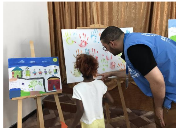
UNHCR staff member with a refugee child during art workshops in Misrata.

During the reporting period, 536 persons approached the CDC seeking assistance, most being spontaneous arrivals. They received available assistance as follows: 226 cases received primary medical assistance; 148 cases had protection interviews