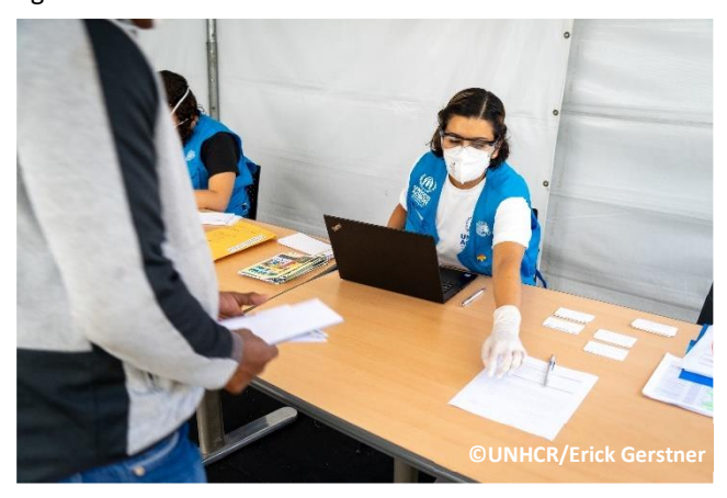
UNHCR staff instructs beneficiary on informed consent form and provides health insurance card.

Health: As part of the strategic partnership between UNCHR and the Costa Rican Social Security entity (CCSS) to provide 6,000 asylum seekers with health insurance in 2020, more than 4,000 PoC have met the criteria for insurance coverage. Despite processing challenges caused by COVID-19 and subsequent related protocols, UNHCR continues to remotely process 500 PoC per week and adapted inclusion criteria to ensure all PoC in high-risk categories are included in the program. Assistance via telephone is also being provided, and UNHCR and the CCSS have information campaigns to ensure all those insured are guaranteed access to medical services.