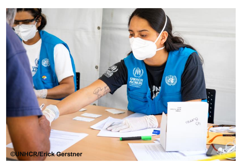
CBI staff instructs beneficiary on informed consent and provides health insurance card