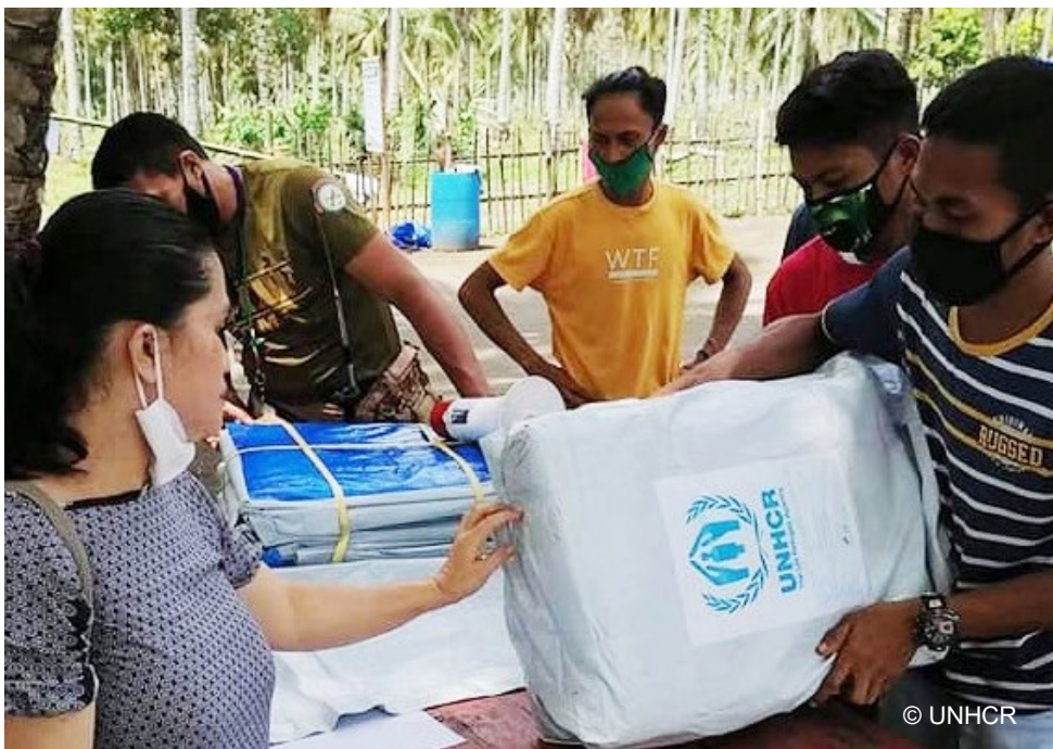
UNHCR and its partner delivered core relief items for 55 displaced families in Barangay Matalin, Malabang, and Lanao del Sur in the Philippines. The solar lamps, plastic tarpaulins, and mosquito nets were given to the Ministry of Social Services and Development - Bangsamoro Autonomous Region in Muslim Mindanao (BARMM) in support of its work in assisting vulnerable persons and improving its response to IDPs during the coronavirus pandemic.