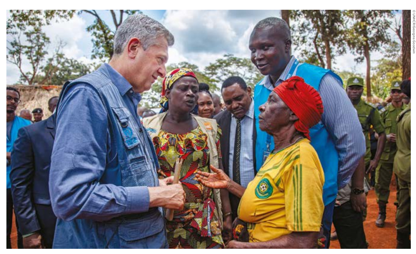
In Nyarugusu camp, in the United Republic of Tanzania, the High Commissioner for Refugees Filippo Grandi talks with an elderly Congolese refugee.

As the decade drew to a close, UNHCR was also stepping up its engagement with the over 43.5 million internally displaced people around the world. A new policy on internal displacement was issued in 2019, placing particular emphasis on protection leadership, solutions and aligning interventions with those of partners. Major IDP operations in the Central African Republic, the Democratic Republic of