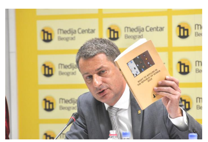
Presentation of "Right to Asylum in the Republic of Serbia" Annual Report for 2019, 27 February 2020

CO in Belgrade and FU in South Serbia for regular protection monitoring in five Asylum Centres and 25 other sites across the country