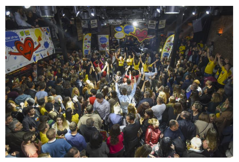
Speak Up for #SolidarityWithRefugees event held in conjunction with the first Global Refugee Forum 17 December 2019, Skopje, ©UNHCR/E.Manevska

1 Representation Office in Skopje, with daily field presence in Tabanovce, and 1 Field Unit in Vinojug Reception and Transit Centres